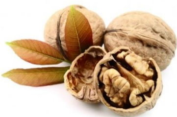
Inshell Walnuts / Walnut Kernels