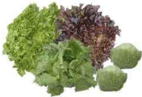
Lettuce Iceberg, Lettuce Lolarosa, Lettuce Lobi