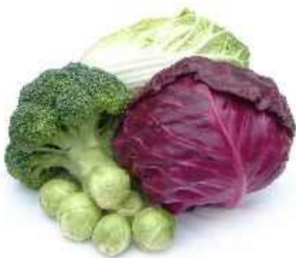
Cole Crops: Broccoli, Cauliflower, Brussels, Sprout, Red Cabbage, Chinese Cabbage, Cabbage Green.