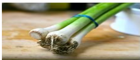
Garlic Green Fresh