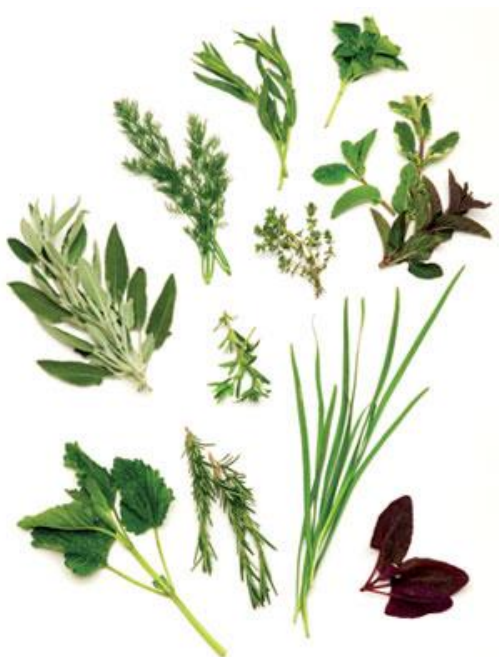
Sage Rosemary Thyme Oregano Lemon Grass Basil