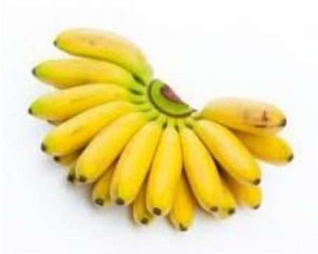
Fresh Banana - Elaichi