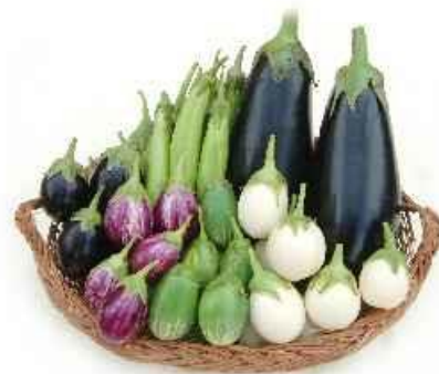
Aubergines / Eggplants