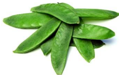
Mangetout Pea / Sno Pea