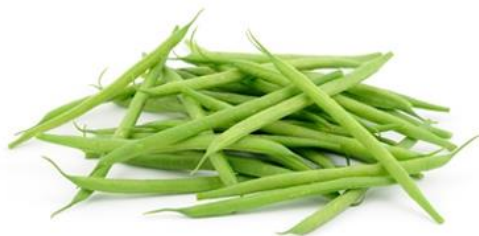
Haricot Verts / Beans