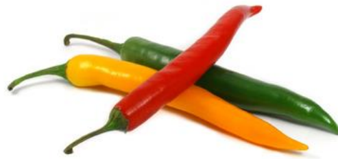
Chilli-Green ,Chilli Hot Pepper and Dry chilli