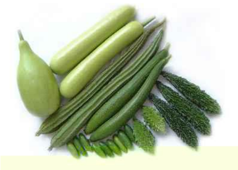
Bottle gourd Bitter gourd Ivygourd / Tindori Sponge gourd Ridge gourd Pumpkin