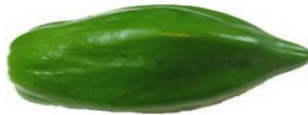
Papaya - Raw